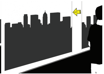
You've left your mark.