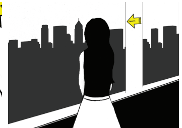
The dialogue of each arrow is posted in the online gallery, where Yellow Arrow users can also post photos and maps.