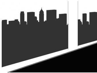
Locate your target.