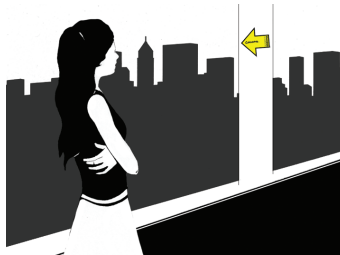
Find a yellow arrow.