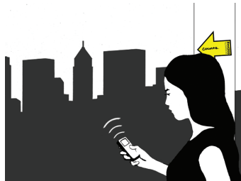
Send a text with the arrow's code and receive the message left by the person who placed the arrow.