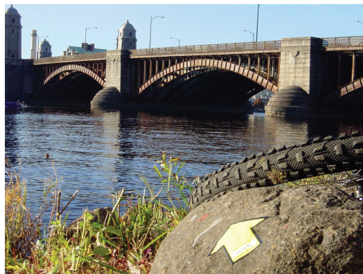
code: yw jaf5 placed by: newurban txt: Caught somewhere between Cambridge and Boston, I wonder, which way do I want to go? We are coming at it from a different angle. location: Longfellow Bridge, Boston