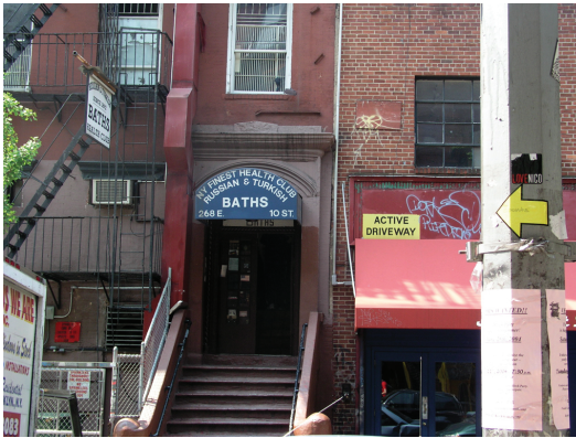
code: yw t2p01 placed by: sirHC txt: In a room hot enough to bake bread he thought out loud, "My dad came here every Thursday. It was like his bar." location: 268 East 10th Street, New York