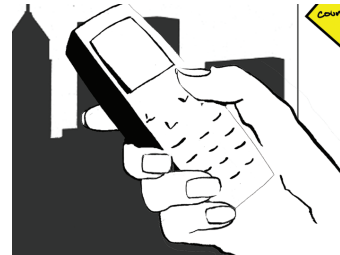
Respond with your comments or post them on the web. The arrow's owner will receive your message.