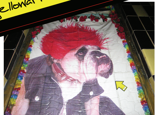
code: yw p5t15 placed by: jshapes txt: Pluto. Longtime witness to the evolution of Oranienstrasse. The aged eyes tell the story of punk revolution to creative playground. location: Oranienstrasse 187, Berlin