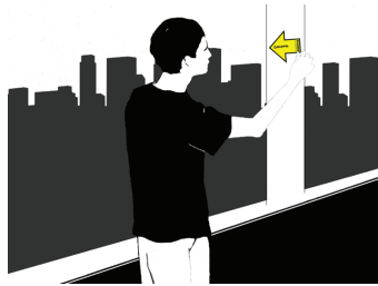
Place your coded yellow arrow. Don't forget to ask for permission!